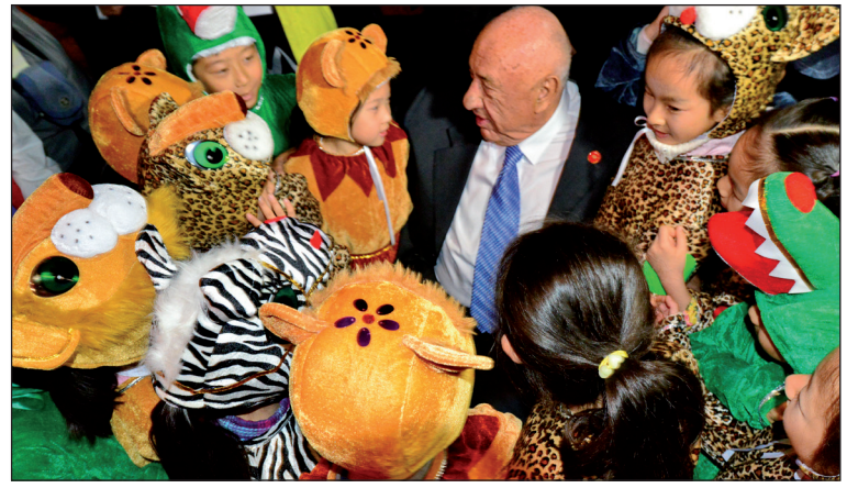
Philanthropist Kenneth E. Behring talk with children to protect wild animals.

Contact the writers at juchaunjiang@chinadaily.com.cn and zhaoruixue@chinadaily.com.cn