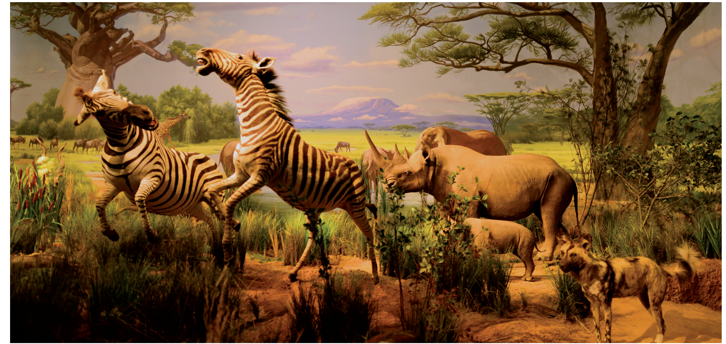
The big migration in Africa.