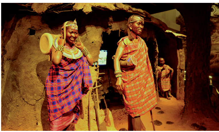
Tribe culture is presented at the exhibition.