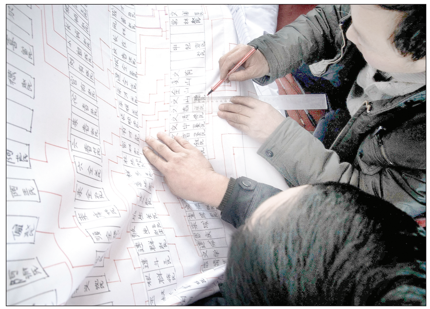
Members of the Hus clan gather at a village in Jilin city, Jilin province, to renew their jiapu in 2012.