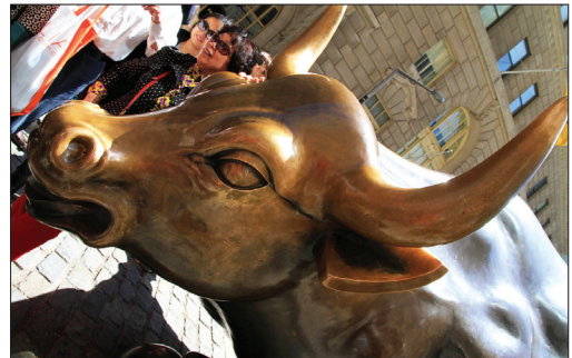
Arturo Di Modica's Charging Bull sculpture on Broadway in Lower Manhattan is a tourist attraction.

On Dec 15, 1989, in an act of "guerrilla art", Di Modica and helpers placed it beneath a