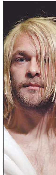
JUNE 10 Shanghai Dramatic Arts Center