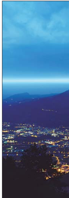
JUNE 8 SUPEC Museum

Italian contemporary art takes the stage until July 11. The visual arts exhibition Contemporary Energy, Italian Attitudes will present oil paintings, photographs, light box and video installations on a theme connected to energy transmission in art.