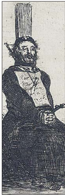
JUNE 7 Cultural Section, Consulate General of Spain

The exhibition Goya, Chronicler of All Wars: The Disasters and War Photography features 82 aquatint etchings by Goya and battlefield photographs from the Spanish Civil War by Robert Capa, David Seymour, Hans Namuth and others.