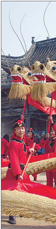
JUNE 6 Expo Square

Hangzhou, the capital city of Zhejiang province, celebrates its city day with more than 340 local professional performers. The five-part stage performance will include Masterpiece , Culture State , and Date with Hangzhou , with theme of "Harnessing Five Waters and Quality Hangzhou". It will be performed three times a day during the week.