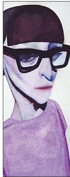
JUNE 9 Eastlink Gallery