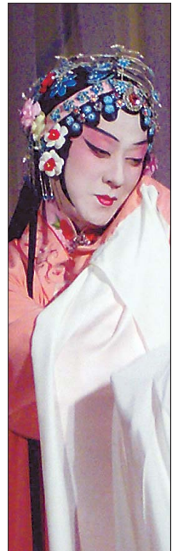
JUNE 11 Lyceum Theater

Japanese kabuki maestro Bando Tamasaburo will collaborate with the Shanghai Kunju Opera Troupe and Suzhou Kunju Opera Troupe to present the classic play Peony Pavilion . Bando, known for his female Kabuki roles, will play the melancholic Du Liniang, who dies during her attempts to try and recollect a romantic dream.